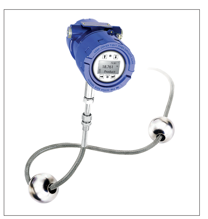
Fig. 2: Tank Slayer® transmitter