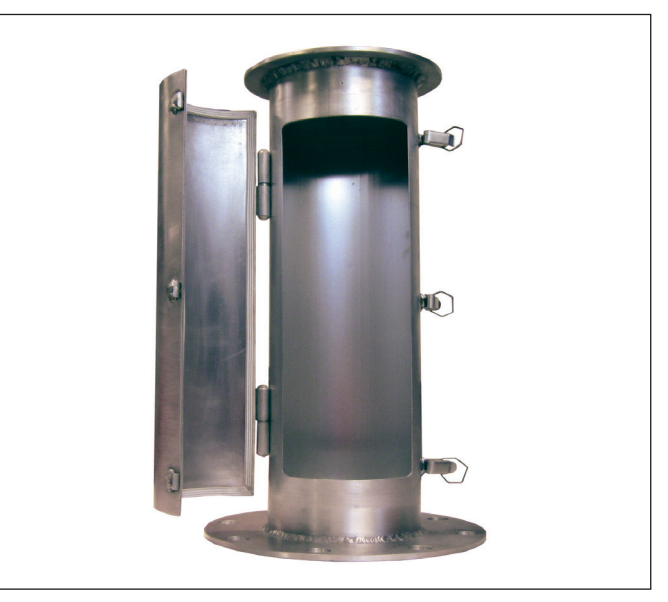
Fig. 4: Spool piece with open door

Temposonics has a better solution. Install the Tank Slayer<sup>®</sup> transmitter and a spool piece (as shown in 'Figure 4') mounted on top of your stilling well. Unlike other level transmitters, the Tank Slayer<sup>®</sup> does not have to be removed or taken out of service during manual gauging, sampling or installation.